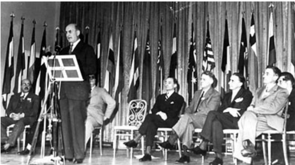
U.S. Treasury Secretary Henry Morgenthau speaking at the Bretton Woods Conference on July 8, 1944.

DISCLAIMER: This investor update has been prepared by the World Bank (International Bank for Reconstruction and Development, IBRD) for information purposes only, and the IBRD makes no representation, warranty, or assurance of any kind, express or implied, as to the accuracy or completeness of any of the information contained herein. This investor brief may include information relating to certain IBRD securities. Any such information is provided only for general informational purposes and does not constitute an offer to sell or a solicitation of an offer to buy any IBRD securities. The securities mentioned herein may not be eligible for sale in certain jurisdictions or to certain persons.