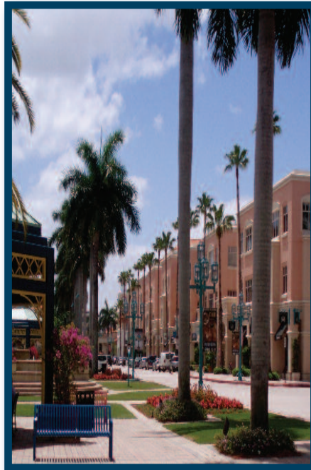
■ Boca Raton